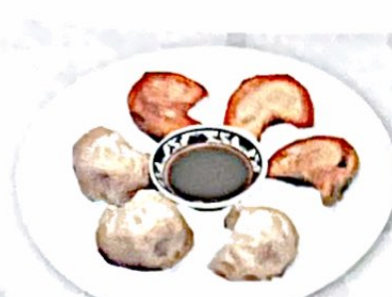
Fried or Steam Dumpling