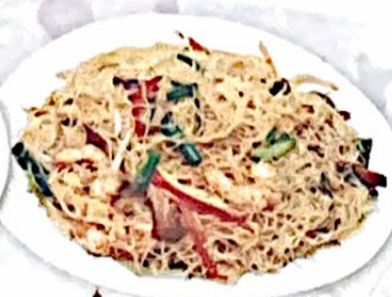
Singapore Mei Fun