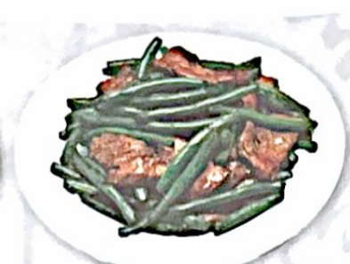
Beef w. String Bean