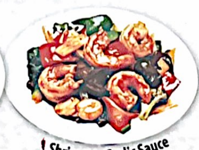
Shrimp w. Garlic Sauce