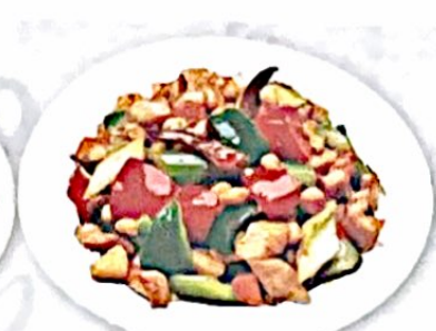
Kung Pao Chicken